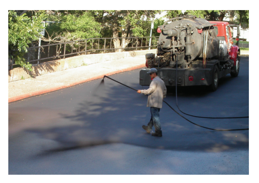
Particles in runoff from coal-tar based sealcoated parking lots had concentrations of PAHs that are about 65 times higher than concentrations in particles washed off parking lots that had not been sealcoated.

Collaborative studies by the City of Austin and the U. S. Geological Survey (USGS) have identified coal-tar based sealcoat—the black, shiny emulsion painted or sprayed on asphalt pavement such as parking lots—as a major and previously unrecognized source of polycyclic aromatic hydrocarbon (PAH) contamination. Several PAHs are suspected human carcinogens and are toxic to aquatic life. Studies in Austin, Texas, showed that particles in runoff from coal-tar based sealcoated parking lots had concentrations of PAHs that were about 65 times higher than concentrations in particles washed off parking lots that had not been sealcoated. Biological studies, conducted by the City of Austin in the field and in the laboratory, indicated that PAH levels in sediment contaminated with abraded sealcoat were toxic to aquatic life and were degrading aquatic communities, as indicated by loss of species and decreased numbers of organisms. Identification of this source of PAHs may help to improve future strategies for controlling these compounds in urban water bodies across the Nation where parking lot sealcoat is used.