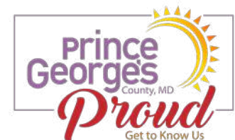
Angela Alsobrooks County Executive