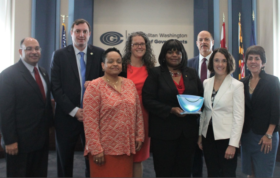
Prince George's County was awarded two Climate Leadership Awards for the County's - one in 2018 for its Sustainable Energy Program and in 2019 for its Food Composting Program.