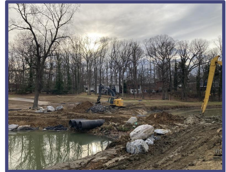
New triple 36-inch culverts