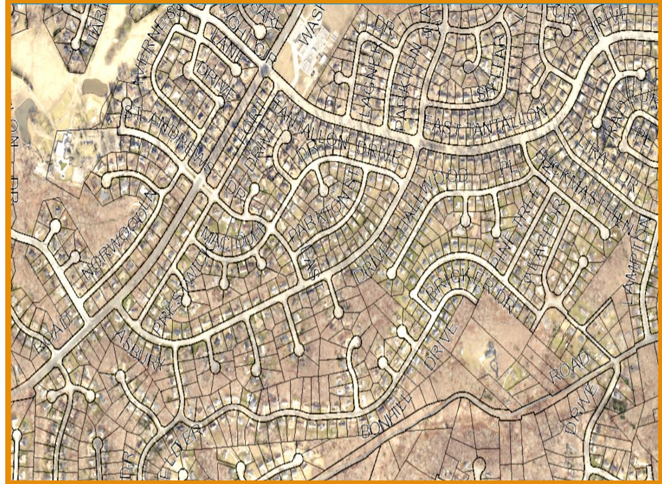
1984 Aerial Image vs. 2020 Aerial Image