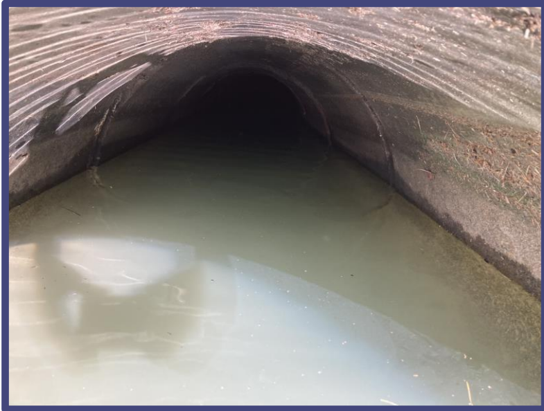
Existing storm drainpipe