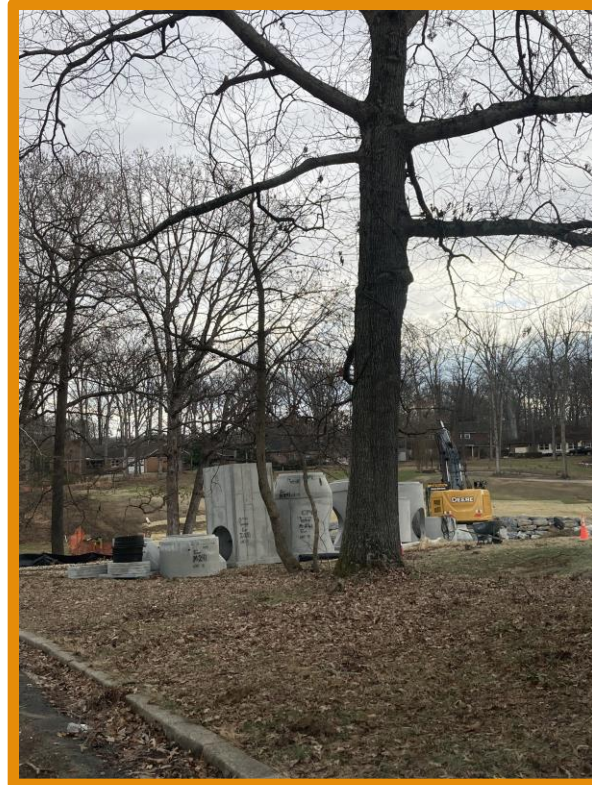
New structures to be installed