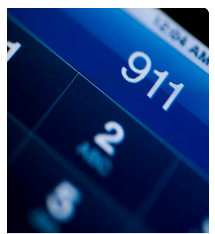
If you think you may be having a heart attack, don't hesitate... call 9-1-1 or your emergency response number immediately. Making the call could save your life.