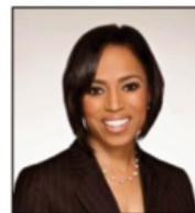
Angela D. Alsobrooks County Executive

Dear Prince George's County Supplier(s) and Business Community: