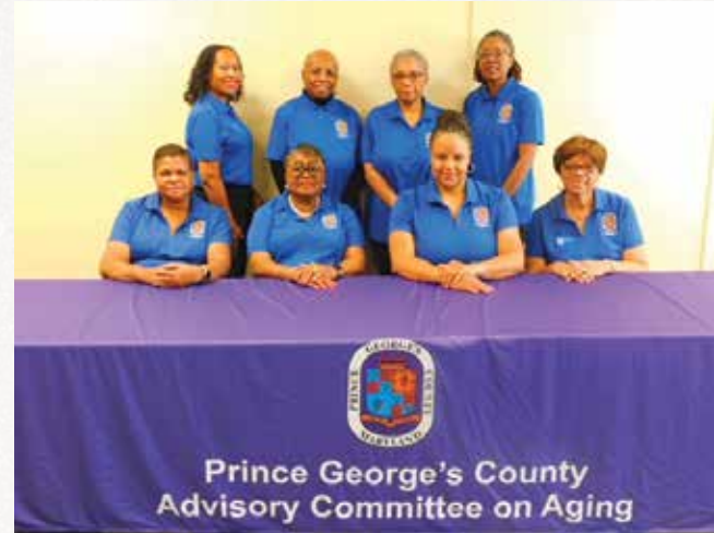
Advisory Committee on Aging Committee Members not included in the group photo:

The Prince George's County Advisory Committee on Aging is comprised of 24 members appointed by the County Executive and confirmed by the County Council to advise them on issues related to aging. The members are citizen leaders representing the public and private community whose mission is to support and advocate the promotion of choice, independence and dignity for all older Prince Georgian's and their families. The Advisory Committee on Aging has oversight of all aging programs including review of the Aging Area Plan to ensure that the goals and objectives are met and reflect the needs of seniors residing in Prince George's County.