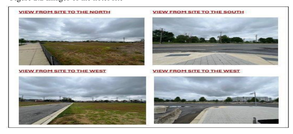
Figure 2.2 Images of the hotel site