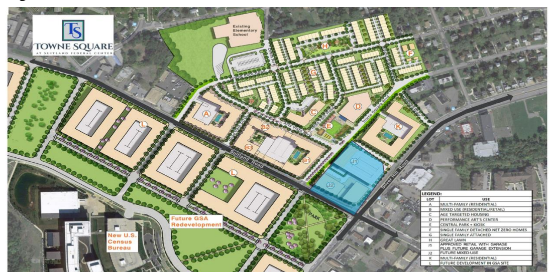
Figure 2.1 Aerial of hotel site within TSSFC

As illustrated in Fig.2 below, the subject site measures approximately 1.37 acres, or 59,764 square feet. It is expected that the site will be developed fully with building and site improvements, thus contributing to the overall profitability of the hotel.